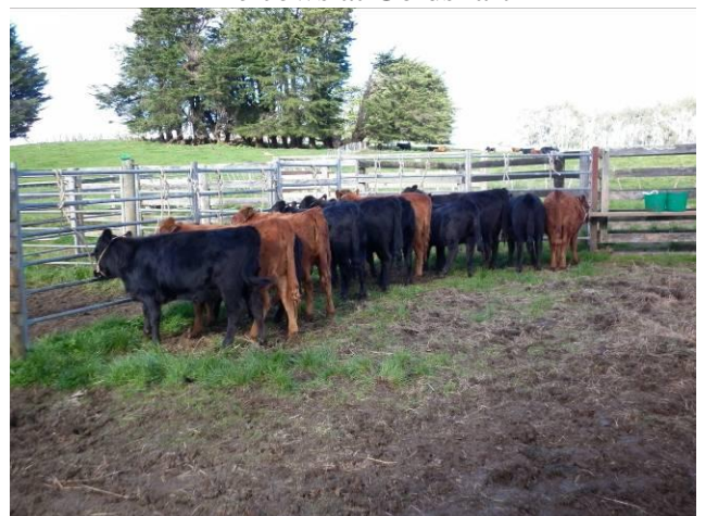
Halter training at Rawlings Dexter Stud