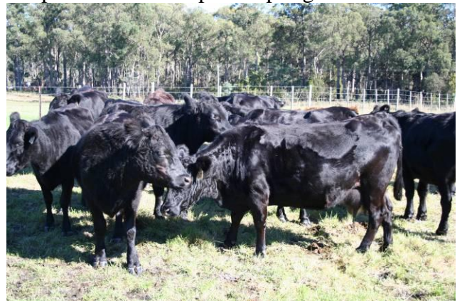
The cows at Goldshaft