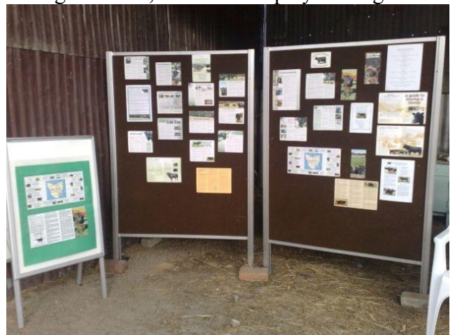
Open Farm at Campania Springs Dexter Stud