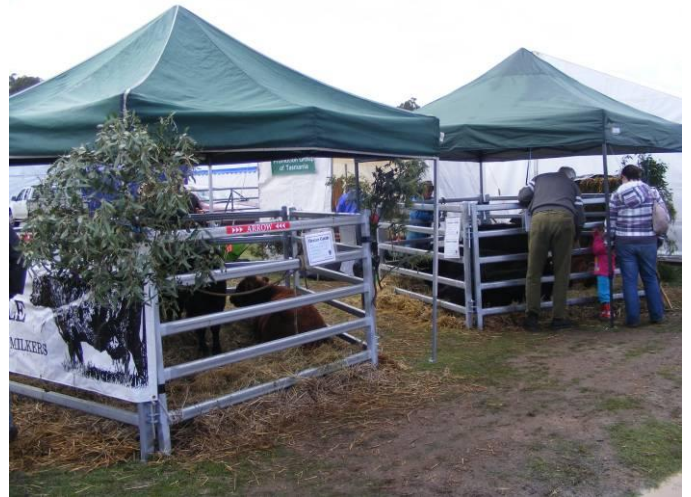
Agfest 2012, don't our displays look great

Marg Rawlings - Phone 6429 1287 rawlingsdexter@westnet.com.au