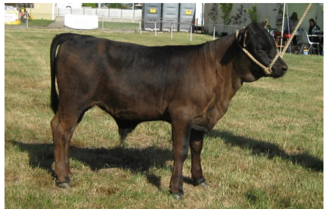
Tazhunt Highland Lad – 11 weeks