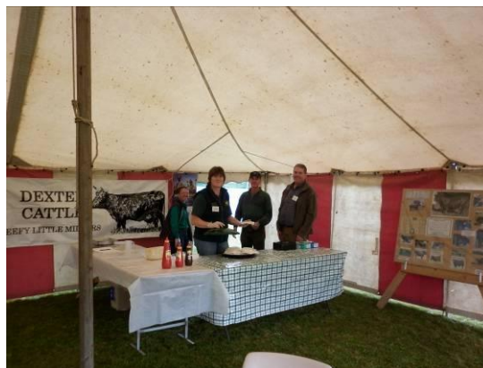
The Taste of the North West – Sheffield

What a month!! It all started with Taste of the North West on the 30 th April where we decided to have another attempt, after rain the previous year, to raise funds towards our Agfest site for 2012. This year the weather was much kinder to us and a group of enthusiastic workers cooked over 400 snags giving us a profit around the $650 mark. Huge effort, well done!!