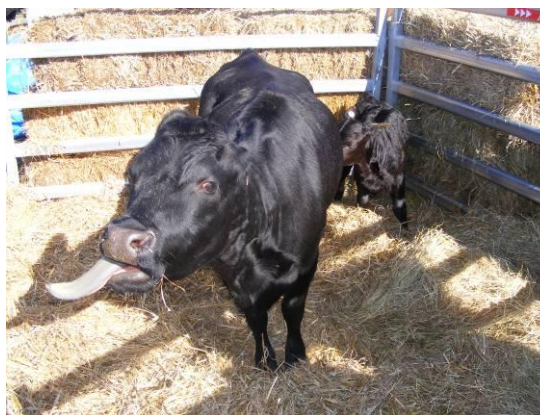
Goldshaft Chautie with the longest tongue you ever saw at Agfest 2011