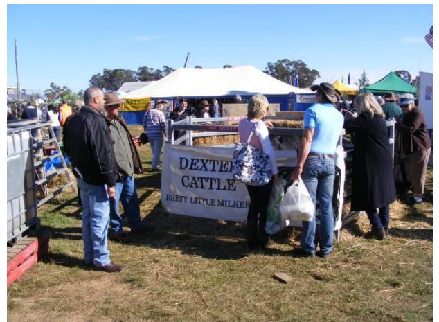
Busy at Agfest