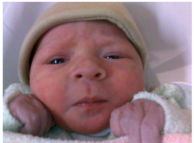
Tara April Fleming- our latest Tassie Dexter addition

Marg Rawlings - Phone 6429 1287 rawlingsdexter@westnet.com.au