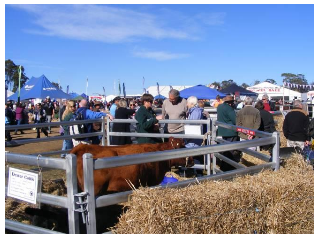
The public just wanted to talk Dexters!