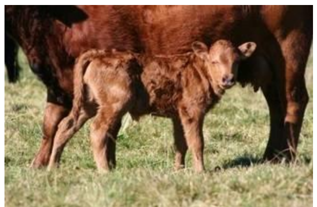
Calving at Goldshaft Elsa and her heifer calf Gazelle