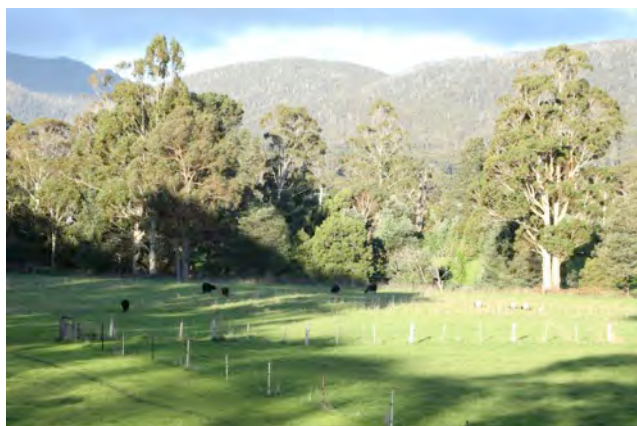
Mountain River Dexter Stud