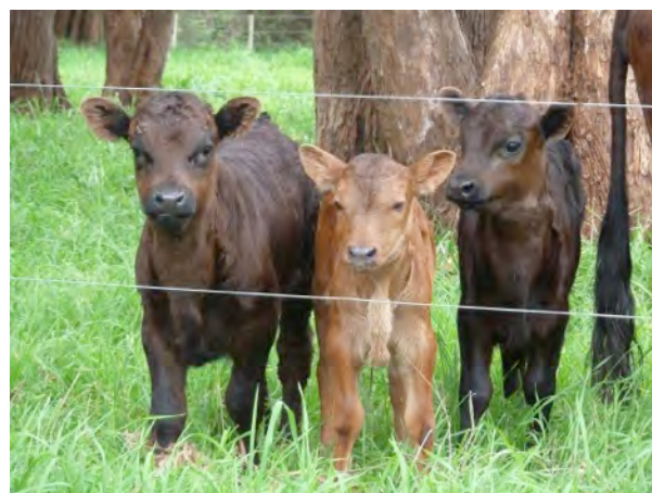
Calves at Wyndex Dexter Stud – Wynyard